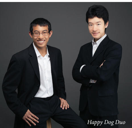
Happy Dog Duo